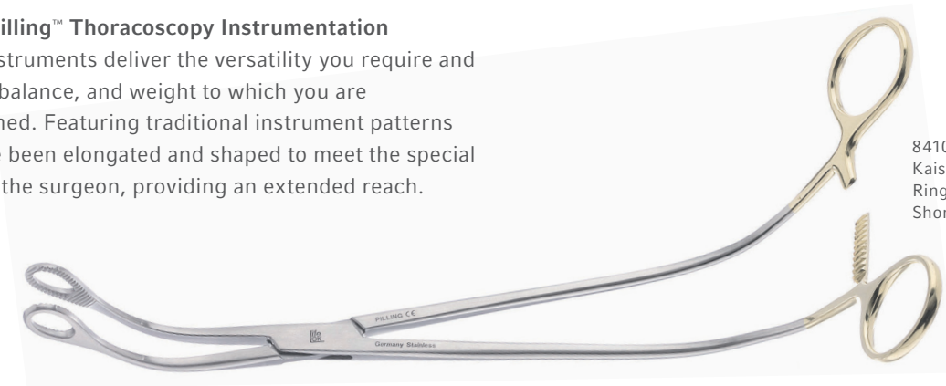
841032 Kaiser-Pilling™ Ring Forceps Short Jaw C-Shape

These instruments deliver the versatility you require and the feel, balance, and weight to which you are accustomed. Featuring traditional instrument patterns that have been elongated and shaped to meet the special needs of the surgeon, providing an extended reach.