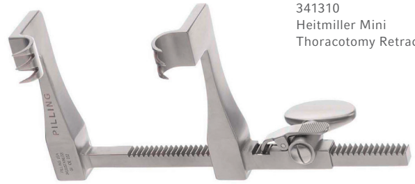
341310 Heitmiller Mini Thoracotomy Retractor

This retractor is designed to provide exposure for video-assisted thoracoscopy, open lung biopsies, transaxillary incisions and MIDCAB procedures in which mini-thoracotomy incisions are used. With its small scale it is also utilized to mobilize lung adhesions during video thoracotomies.