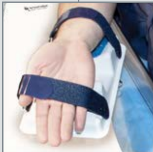
Splint Stabilizer for optional use with Accumed™ wrist positioning splint