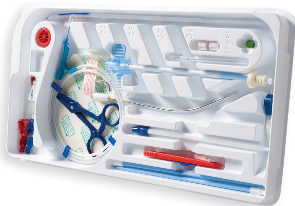
Arrow® NextStep® Antegrade Hemodialysis Catheterization Kit (CS-15232-SFX)

To learn more about Arrow® NextStep® Catheters: contact your Teleflex Representative