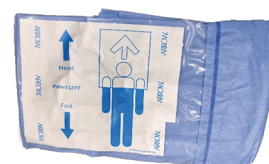
Catheter Insertion Tray